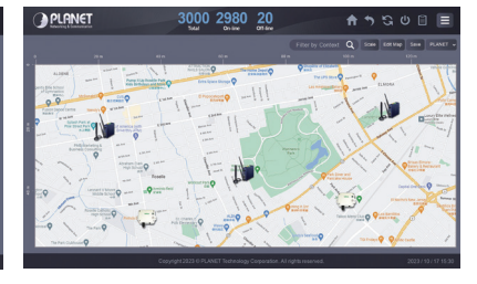
Centralized Management of IoT Devices